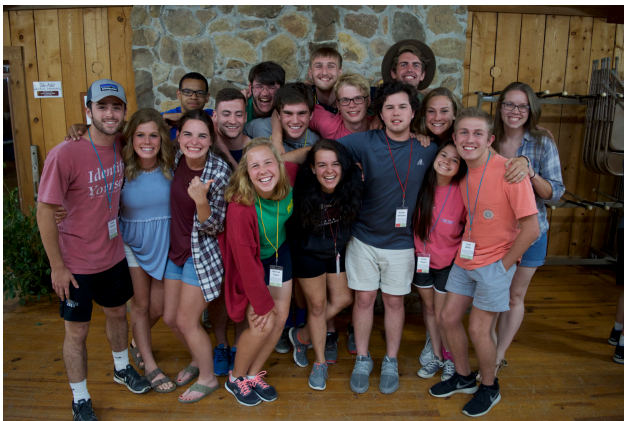
Senior Group from June Camp

Because we have a brand new self, we have been made righteous and complete before God. And further good news is that because we have the indwelling of the Holy Spirit, we can have victory over the power of sin indwelling our flesh that can sometimes manifest itself in our daily behavior. It's so critical for all of us, but particularly so in these young lives, to know how much they